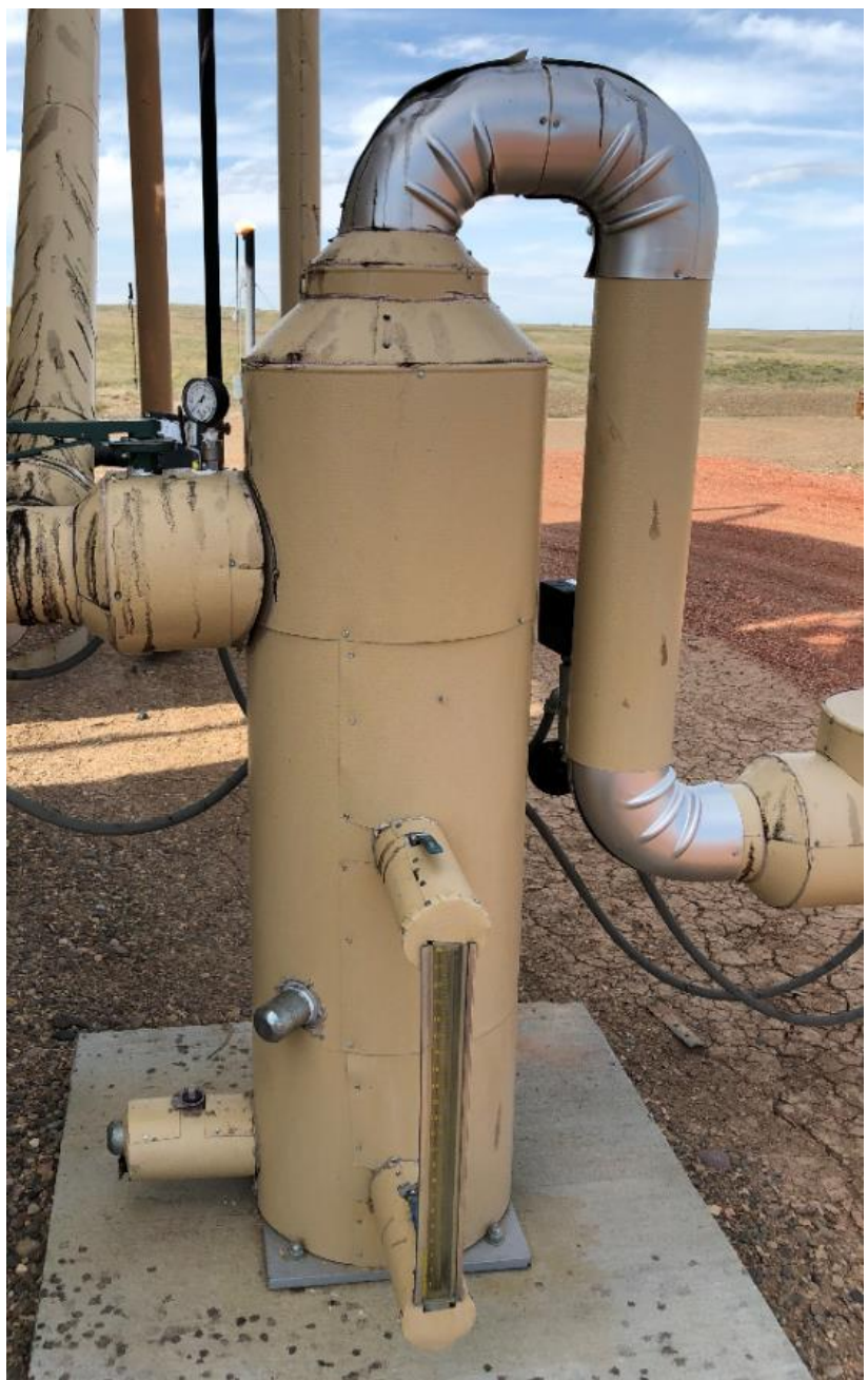
Figure 4: Vertical Knockout Vessel with Pocketed Discharge Line

In this case, a larger knockout vessel was required to meet the liquid separation requirements. Vertical knockout vessels typically do not achieve the same liquid droplet separation as similarly sized horizontal knockout vessels. The table below compares the maximum vapor capacity of a 24" O.D. by 4'-0" S/S knockout targeting a liquid droplet separation of 250 microns and larger on one of the facilities. The horizontal vessel can achieve the same separation at a higher vapor flowrate because the drag force on the droplet is not directly opposing the gravity settling force in a horizontal vessel. In a vertical vessel, the drag force acts the opposite direction of gravity settling and causes larger droplets to be swept into the outlet of the vessel and to the flare. This was a common issue with existing equipment and required larger knockout vessels when compared to horizontal vessels.