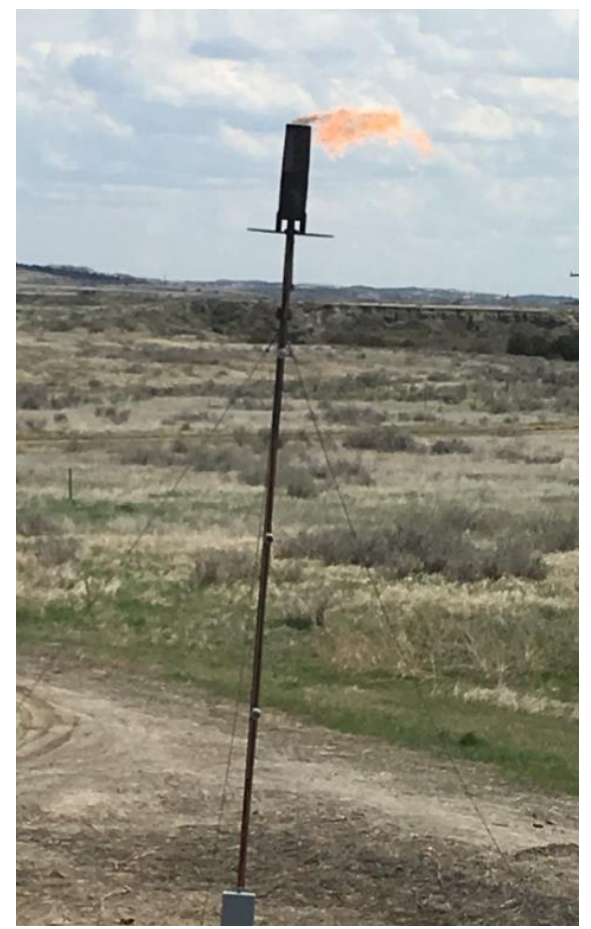
Figure 5: Existing Flare That Was Replaced

Flare selection is also an important step in design. Combustion efficiency is a requirement for compliance with Quad Oa and a number of flares were not meeting that requirement and needed to be replaced. The figure below shows one of the existing flares that needed to be replaced because it was not installed in the correct service. This flare was intended for high pressure systems where high velocity across the tip can ensure good mixing and combustion of the vent gas. Tank flares require flares designed for low pressure drop such as ball-tip flares or air-assist flares. Air-assist flares were installed on a number of the larger sites to help minimize the pressure required and handle the higher capacities.